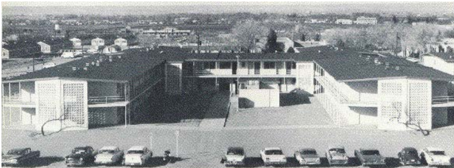
An aerial view of Regents Row Residence Center shows its distinctive architecture and new parking area. The newest dormitory at New Mexico State, it was opened in the fall of 1992.

The Demolition of Regents Row is on the Five Year Facilities Plan (2027-2022). Taking the building off-line will reduce annual maintenance costs by $675,000. A relocation plan for the current occupants has begun. Offices occupants must be moved out by the end of the spring 2017 semester. Discussions and concerns addressed included the hawks, the adjacent parking lot, removal of trees, and proposals for a new office swing space. Care will be taken to remove as few trees as possible when demolishing the building; none are planned to be cut down at this time. There will be an attempt to not disrupt any hawk habitat during the removal. Once the Jett Hall occupants are returned to the renovated Jett Hall building, this should be the last scheduled large displacement of offices. Unforeseen emergency conditions could come up, such as displacement due to fire. When and if that occurs, the warehouse has been discussed as a swing space. The Space Committee will identify a new temporary location for office, replacing the service Regents Row has provided.