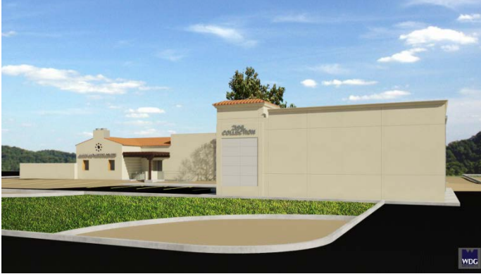
Image of addition from College Drive