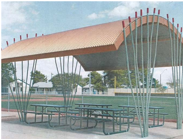
Option A - Ocotillo shade pavilion, approximate cost $16,540

Also proposed as part of the Desert Garden is a Prefabricated Shade Structure. Options for the shade structure were discussed.