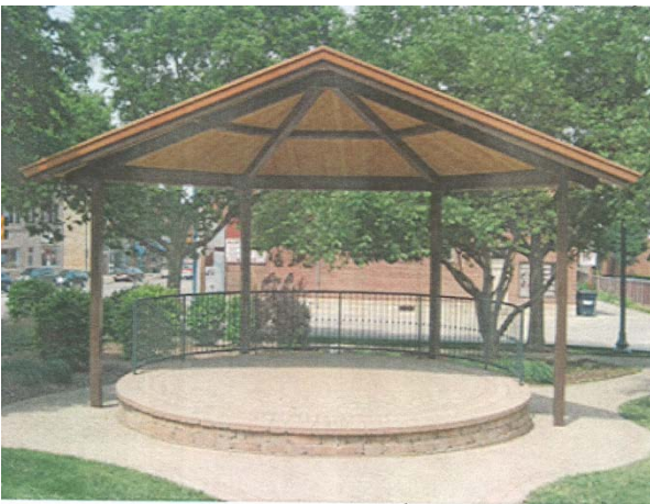
Option C - Half hexagon shade pavilion, approximate cost $13,750.

The three options were discussed. Option B and C would require modifications for a more enclosed feel at the sides of the structure, but workable with lower purchase cost. The CPC recommended against Option C. Option A and B (with modifications) were acceptable. Option A was the preferred option.