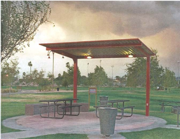
Option B - Marana shade pavilion, approximate cost $8,970 (will require alterations to partially enclose sides/back of structure).