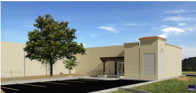
Image of new entry at addition.

Recommend approval, for Alumni and Visitor Center Addition. (Moved to vote; seconded; all in favor)